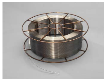
Wire for MIG welding