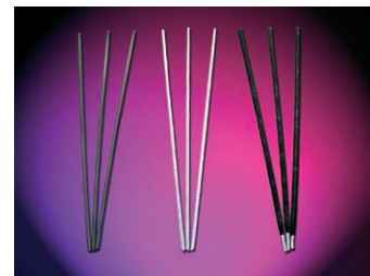
Sintered and/or dipped electrodes for manual arc and TIG welding