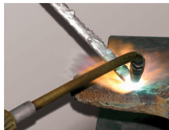
Composite welding rod for oxyacetylene welding