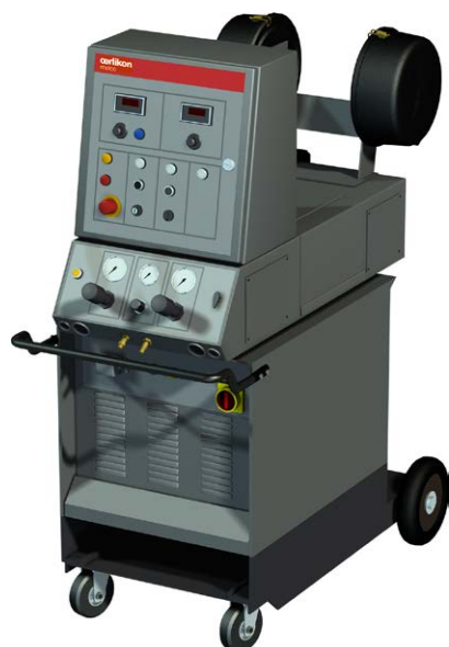
SmartArc PPC Console and 350RU Power Supply (shown with optional Power Supply Truck)

When used with Oerlikon Metco's extensive portfolio of high quality wire arc materials, SmartArc delivers superior coatings, at high deposition rate, and with ease.