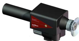
SmartArc PPG Wire Arc Spray Gun

Truly automated, SmartArc incorporates rugged and reliable PLC (programmable logic control) computer technology for its advanced feature capability and provides diagnostics tests that are easily interpreted by the operator.