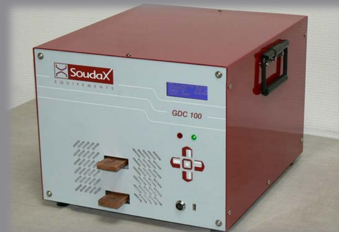
GDC 300 Joules