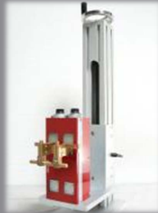
Double pneumatic welding head 10 daN*