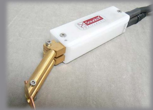
Parallel welding handle SHUNTER