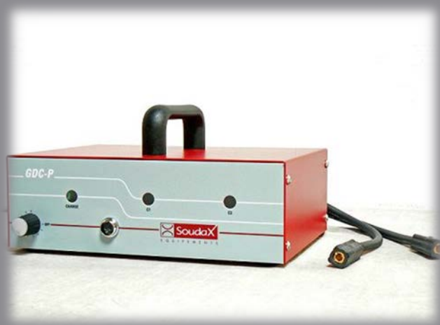
Portable GDC 100 Joules*