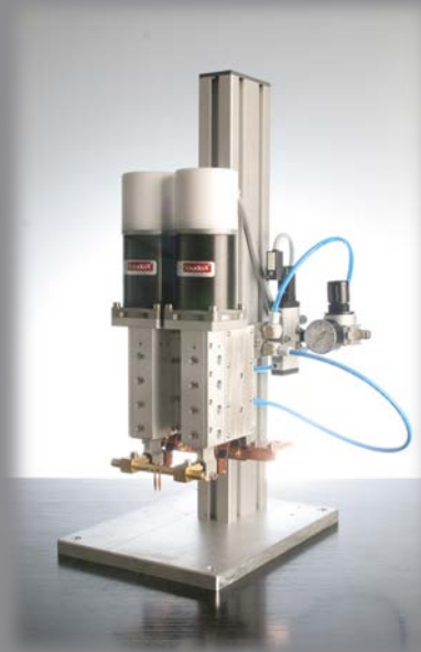
Double electromagnetic head 10 daN