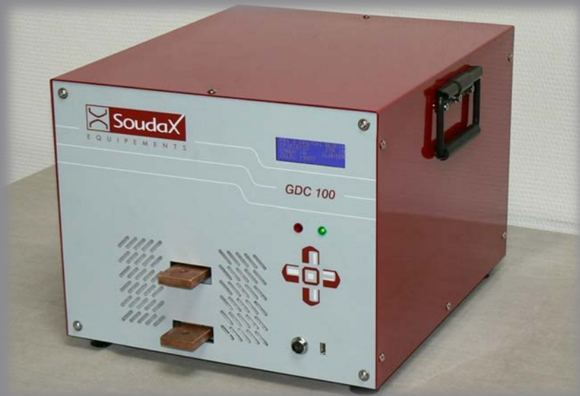
Capacitor discharge generator 300 Joules