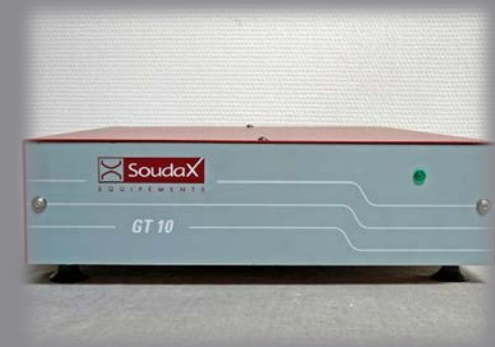
TEM D 10 dAN generator