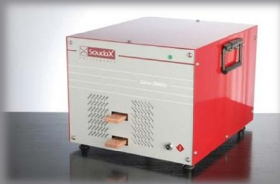
Medium frequency generator 5kA

◆◆◆ For Lithium-Ion, high production rate, traceability